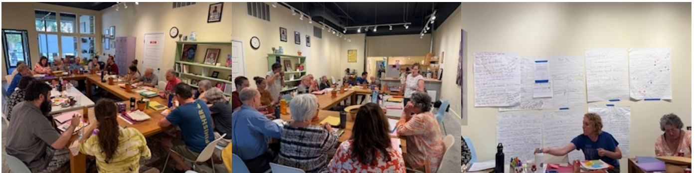
Images from our recent board retreat

Services in blue. Excludes Shabbat services. See High Holidays Bulletin for more information on all events. Register here for High Holidays services.