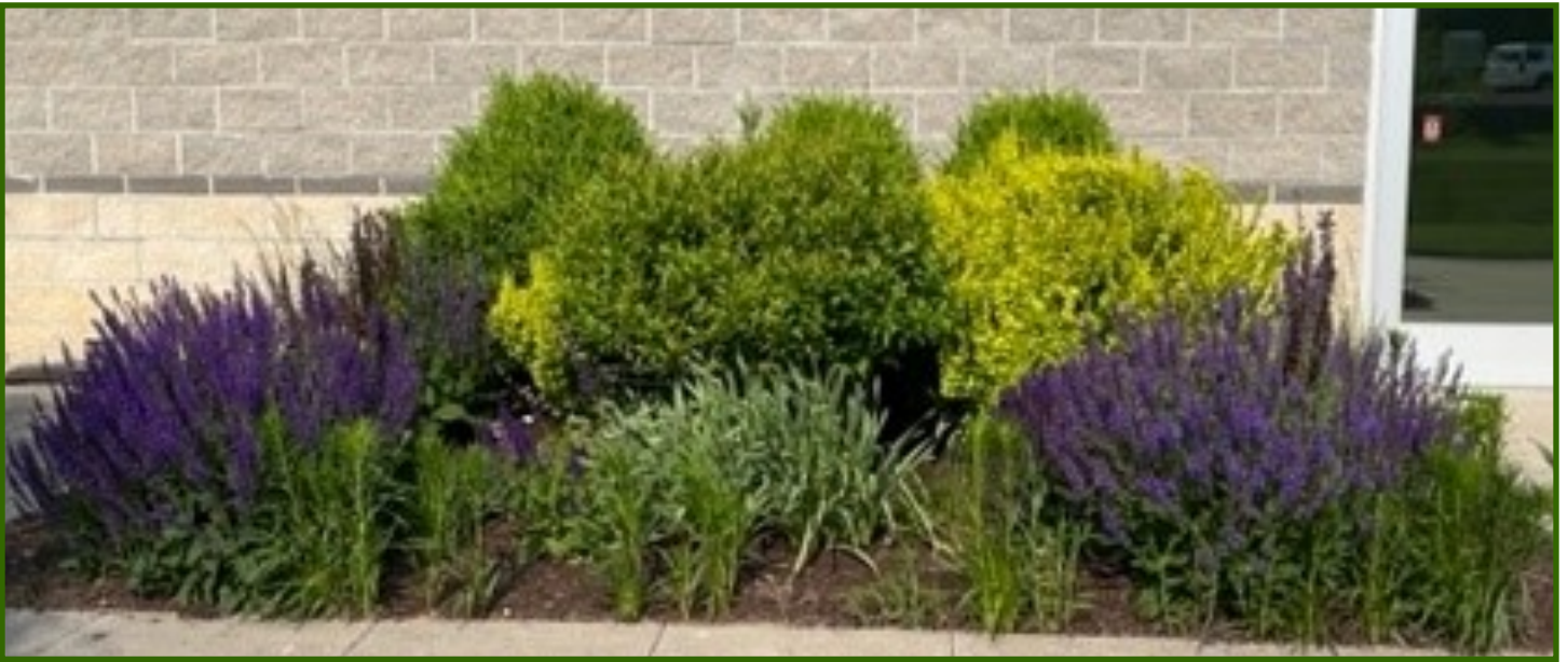
Above: The Biblical Garden (thanks to Pat Levin!)