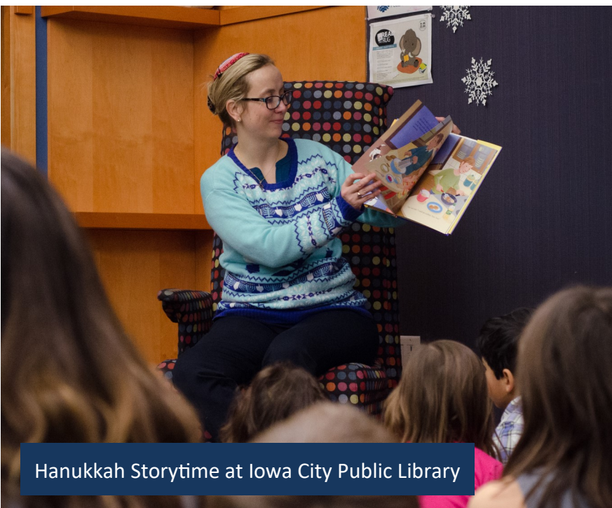
Hanukkah Storytime at Iowa City Public Library